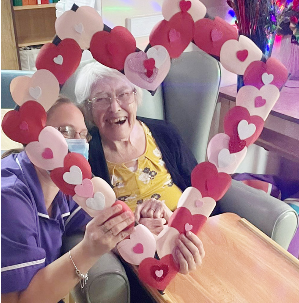
Our residents had a lovely time on Valentine's Day!