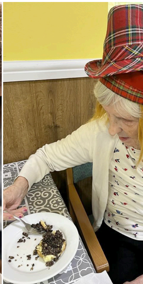
In haggis heaven!