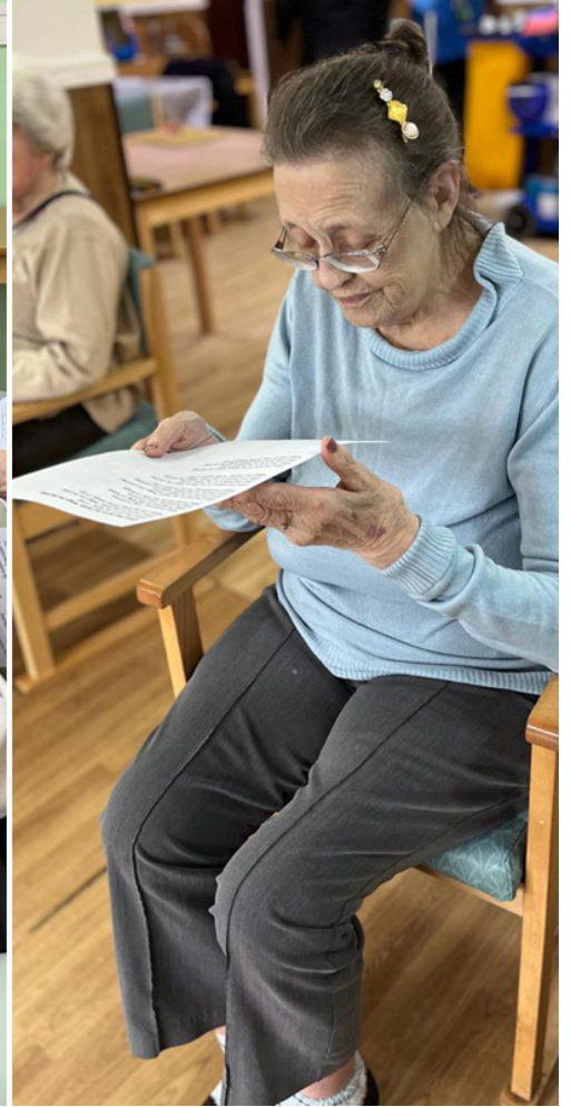
Our residents enjoy praying and singing together